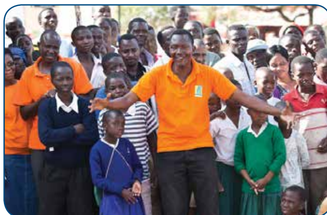
A CAT member engages a crowd at a community health fair.