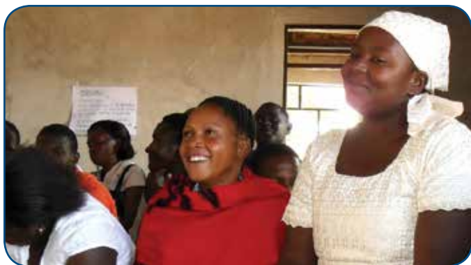
Community health talk in Mbeya Region, 2010