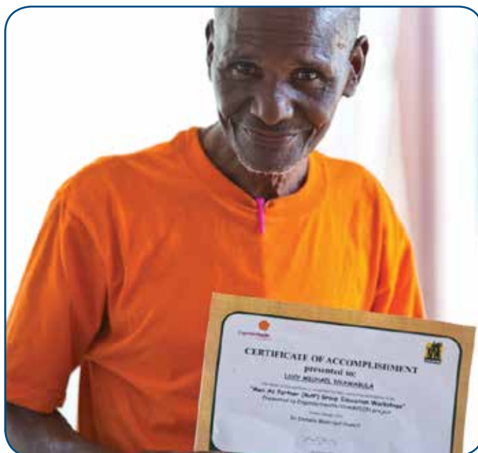
Graduate of a community-based Men As Partners® (MAP®) group education workshop

CHAMPION’S experience has shown that community partners and grassroots activists are well-positioned to identify and challenge social, cultural, and gender norms that negatively influence SRH behaviors and outcomes. Communities are key partners in identifying priorities for change and in leading such change. Investments in building the capacity of local partners and supporting them in planning, implementing, and evaluating actions to challenge and address gender-inequitable norms in their communities are critical for achieving and sustaining social and behavioral change.