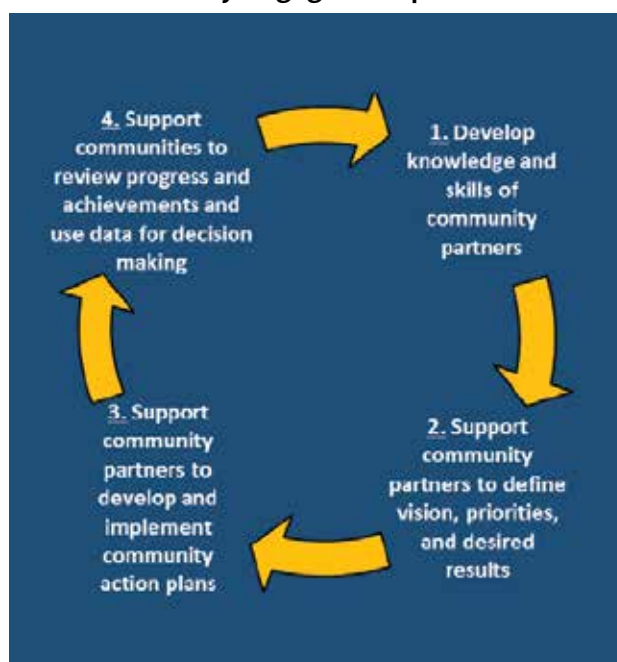
Figure 1. Essential elements of community engagement processes

In focus districts, CHAMPION worked with local government authorities and stakeholders to identify a diverse range of influential community partners and potential champions for transforming gender norms. These partners ranged from LNGOs and community-based organizations to community officials and leaders to local activists interested in working together to champion equitable gender norms to address HIV and GBV in their communities.