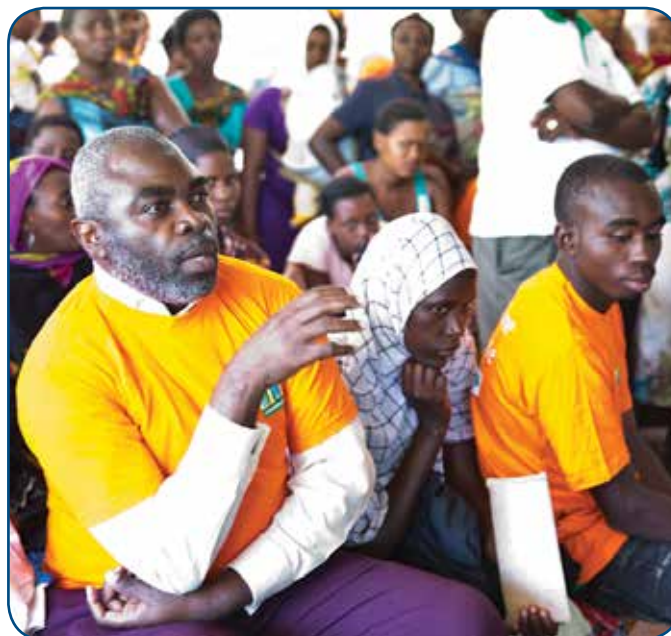
A CAT member participating in a health facility dialogue about the importance of men’s seeking health care and accompanying their partners for reproductive and maternal health services