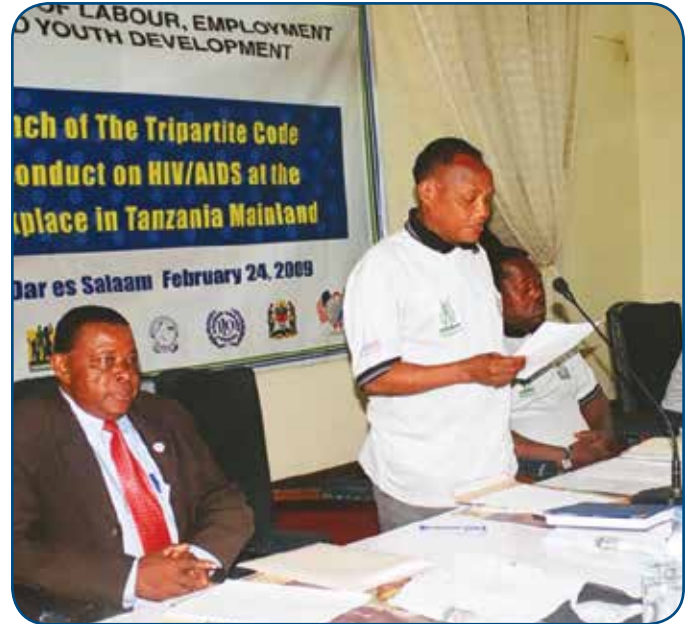
Tripartite Forum member provides remarks during the Ministry of Labour, Employment, and Youth Development launch of the Tripartite Code of Conduct on HIV and AIDS at the Workplace in the Tanzania Mainland in 2009.

The ILO should continue to advocate for the importance of the workplace as a strategic venue for awareness-raising, prevention, care, and the protection of worker's rights. The efforts of individual forum partners contribute to a stronger, more cohesive national response to HIV and should be encouraged to share lessons learned with the TPF partners. The ILO Code of Practice on HIV/AIDS and the World of Work (ILO, 2003) and Recommendation concerning HIV/AIDS and the World of Work (No. 200) (ILO, 2010) are powerful and adaptable tools that partners should continue to use to initiate and extend action in the world of work. These documents paved the way for the development of an