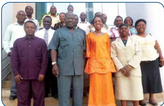
Members of the Tripartite Plus Forum for HIV and AIDS in the World of Work at the ILO office in Dar es Salaam after a quarterly meeting.

As cofounders of the forum, CHAMPION advocated for male involvement and gender equality as critical in addressing HIV in the workplace. Through the TPF mechanism, the project provided financial and technical assistance and capacity development to five partners representing the government, employer associations, and employee unions, including the Ministry of Labour and Employment (MoLE), Occupational Health and Safety Agency (OSHA), Association of Tanzania Employers (ATE), Trade Union Congress of Tanzania (TUCTA), and AIDS Business Coalition of Tanzania (ABCT). CHAMPION trained 20 national workplace trainers from the ABCT, ATE, TUCTA, and MoLE, as well as an additional 90 labor officers from MoLE, on the Men As Partners® (MAP®) curriculum and on male engagement in health through the workplace. Topics covered included HIV prevention, gender-based violence (GBV), reproductive health (RH), and facilitation skills.