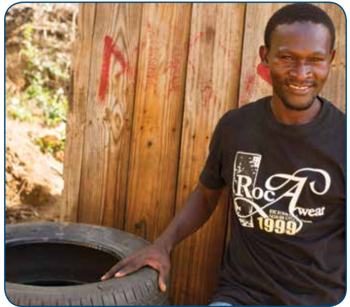
Mobile worker from the Morogoro Region after attending a workplace HIV education session.

To ensure the long-term viability of this important network, a more sustainable financing and management/coordination mechanism is needed that distributes responsibility for forum operations among all partners. To date, the ILO and CHAMPION provided in-kind support to ensure that the forum convened consistently. An additional challenge was linking local labor officers from the MoLE trained by CHAMPION to workplace programs when they were not already associated with specific worksites. Future projects should work with the MoLE to consider ways to link this cadre of trainees to sites they can directly support.