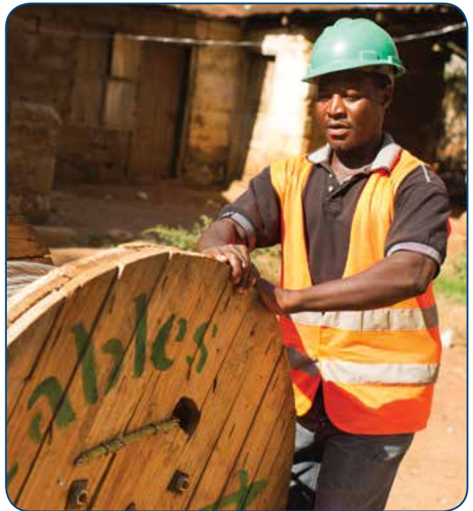
Symbion Power employee at work after participating in an HIV education session led by a fellow worker trained by CHAMPION as a workplace-based peer health educator

"Since 2009, CHAMPION provided important technical and financial support to the Tripartite Plus Forum for HIV and the Work of Work, enabling several member companies to develop effective workplace HIV and AIDS policies and interventions. CHAMPION also built the capacity of ATE trainers to facilitate workplace-based education dialogues on HIV and gender equity. Now we can conduct these dialogues ourselves."