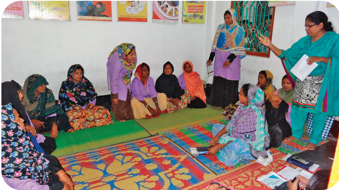
Orientation and training of BRAC CHWs

community health resources and other local institutions, and helped to mobilize others towards the goal of achieving a fistula-free Bangladesh.