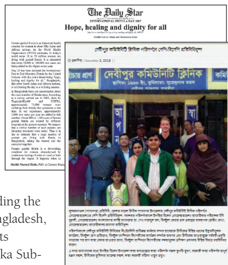
English and Bangla language media coverage of fistula activity in Bangladesh

FC+ worked extensively with electronic, print, radio, and television journalists to increase Bangladeshi media coverage of issues related to fistula. In partnership with supported facilities and select media organizations (including the Press Institute of Bangladesh, the Female Journalists Association, the Dhaka Sub-Editors Council, the Bangladesh Health Reporters Forum, and the Ministry of Information),