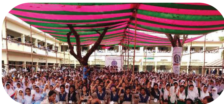
Schoolgirls for a Fistula-Free Bangladesh assembly in Satkhira.

FC+ also collaborated with USAID’s Advancing Adolescent Health project to build youth capacity to prevent fistula and advocate for fistula care. The Schoolgirls for a Fistula-Free Bangladesh initiative included training and outreach for over 3,000 high school teachers and students, local and national government health officials, and NGO representatives across the country. FC+ provided orientation on reproductive health, gender equity, early marriage, fistula, and other related issues. Each schoolgirl interacted with pregnant women in their community to share their knowledge on topics including fistula prevention and pregnancy warning signs. Students earned points for activities such as pledging to delay marriage, referring pregnant women for hospital delivery, and identifying and referring women with fistula symptoms for treatment. Students earning 100 points were certified as “Fistula Champions,” and recognized through a public appreciation ceremony. Through this initiative, FC+ linked students with