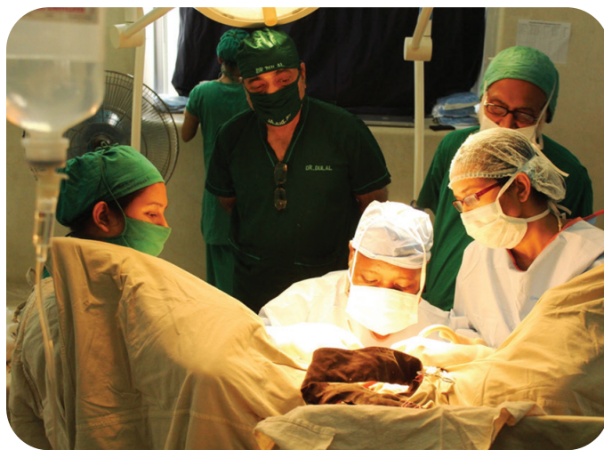
Fistula surgery at Kumudini Hospital

Bangladesh is experiencing a cesarean section epidemic. An FC+ study with the London School of Hygiene and Tropical Medicine found that the majority of facility births are by cesarean. 7 Furthermore, FC+ identified iatrogenic fistula following unsafe hysterectomy and cesarean as the cause of more than 30% of fistula cases diagnosed at supported facilities. These trends in surgery volume and iatrogenic fistula suggest that the Bangladeshi fistula burden may substantially increase in the coming years without continued investment in fistula care and safe surgery. FC+ highlighted these issues with clinical and health policy communities in Bangladesh, encouraging a focus on safe surgical practices generally and safe cesarean practices specifically. FC+ supported the OGSB in developing a continuing medical education program focusing on safe surgery and ethics in practice. OGSB also issued a position paper on iatrogenic fistula in 2017.