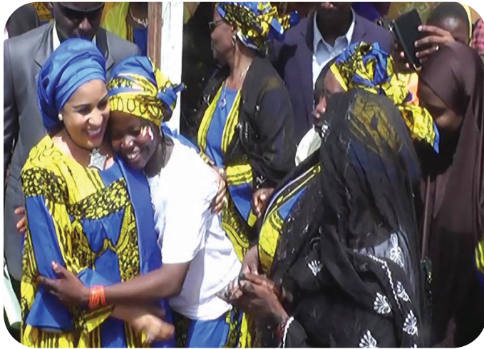
Niger's First Lady Dr. Lala Malika Issoufou greets fistula clients during IDEOF celebrations in 2017.

opportunities for high-level visibility around fistula efforts, such as provider roundtables on the annual commemoration of the International Day to End Obstetric Fistula (IDEOF), on May 23. The Nigerien First Lady, Dr. Malika Issoufou, is a dedicated supporter of the fight against fistula in Niger and, together with the Ministry of Health, played an active role in IDEOF celebrations and other community events and initiatives. The project also worked with REF to build their capacity related to administrative procedures, financial management, and monitoring and evaluation, to enable them to receive, track, and report effectively on external funding during the FC+ project and beyond.