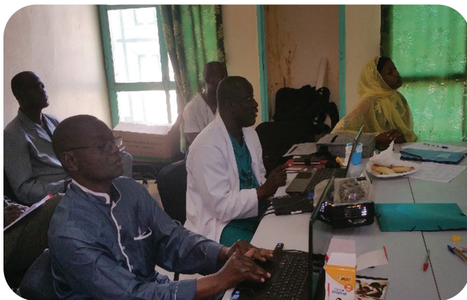
Infection prevention training at CSME Maradi.

obstetric and newborn care, and infection prevention and control. FC+ and REF followed up with supportive supervisory visits using tools aligned with national quality assurance and quality improvement approaches to ensure skills retention, track progress, and provide continued on-site technical assistance to improve service quality in the clinician's own working environment.