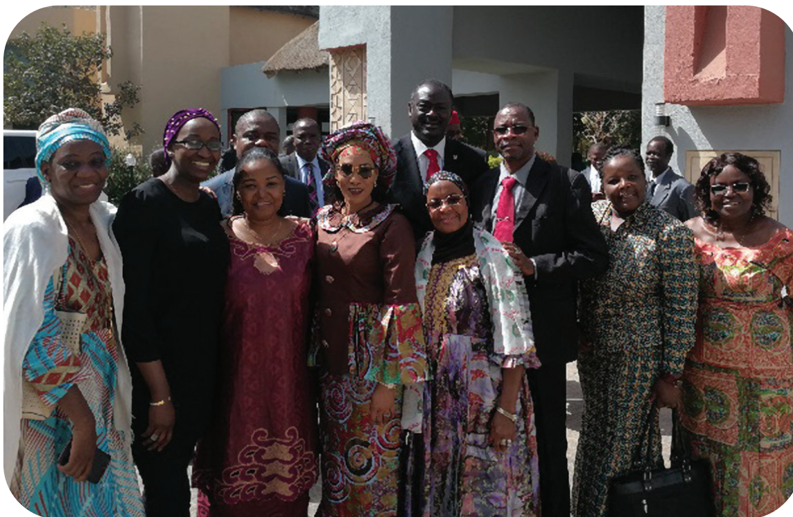
Banjul workshop participants, including the First Lady of the Gambia