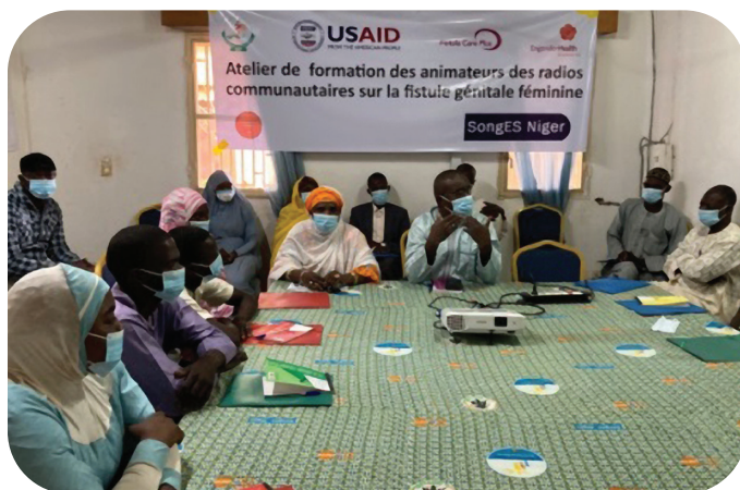
Radio host training.

The project supported REF and SongES to utilize local community and national radio broadcasts to increase community awareness about causes of fistula, prevention approaches, and the availability of treatment. Community radio is particularly effective for reaching populations in remote areas. SongES held workshops with radio programming staff to introduce them to information about fistula prevention and treatment and encourage development of programming related to fistula. FC+ and our partners created content for radio programs, including recorded programs and live interviews with representatives from government agencies and treatment facilities covering general sexual and reproductive health issues as well as the availability of fistula and pelvic organ prolapse services. The project timed broadcasts to mobilize potential clients to seek treatment during concentrated repair efforts at supported hospitals. Over the course of the project, FC+ supported 317 mass media activities, reaching an estimated audience of more than 589,000 people.