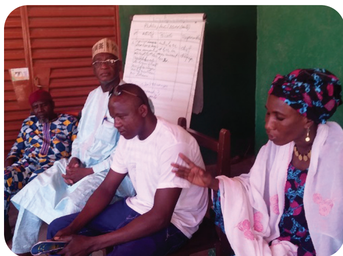
Training of community volunteers.

FC+ and REF collaborated with mayors of municipalities and district health officials in priority regions to identify integrated health centers, or Centres de Santé Intégrés (CSIs), and to reach out to communities. Under the supervision of officials from the health districts and the regional health directorates, the leaders of the CSIs identified community volunteers from villages and CSIs in Dakoro, Guidan Rumdji, Madarounfa, and Mayahi in the Maradi region and Bouza and Illela in the Tahoua region. REF adapted their existing community volunteer training materials to include comprehensive fistula, maternal health, and FP information and trained volunteers. The trained volunteers also participated in supplemental trainings carried out by Health and Development International, an NGO that has collaborated with the Government of Niger on community-based prevention of obstetric fistula since 2008.